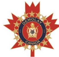
DeMolay for Boys